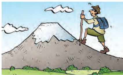
climb Mt. Fuji

A ▶ 1:08 Read and listen. Then listen again and repeat.