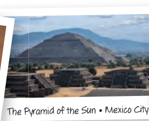
The Pyramid of the Sun • Mexico City