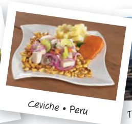
Ceviche • Peru