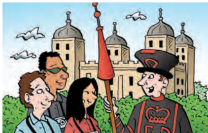
take a tour of the Tower of London