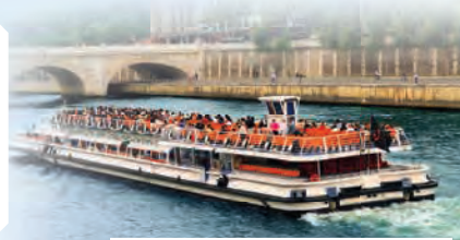
Tour boat on the Seine River