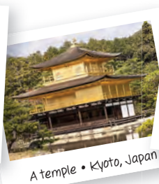
A temple • Kyoto, Japan