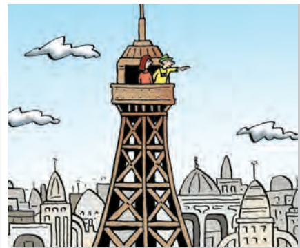
go to the top of the Eiffel Tower