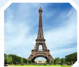
The Eiffel Tower