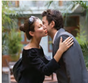
Some people kiss once. Some kiss twice.