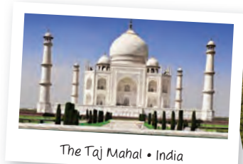
The Taj Mahal • India