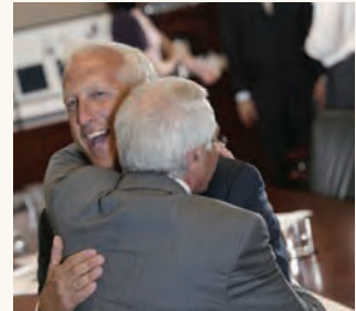
And some hug.