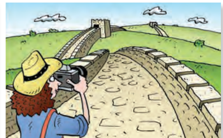
take pictures of the Great Wall

B PAIR WORK Use the Vocabulary to say what you have and haven't done.