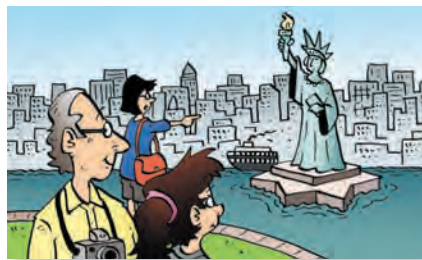
go sightseeing in New York