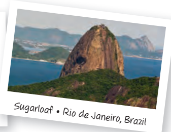
Sugarloaf • Rio de Janeiro, Brazil

C Write five questions about tourist activities in your city or country. Use yet , already , ever , and before .