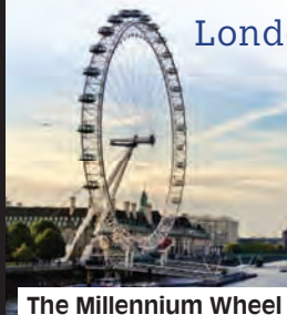
The Millennium Wheel