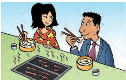
try Korean food