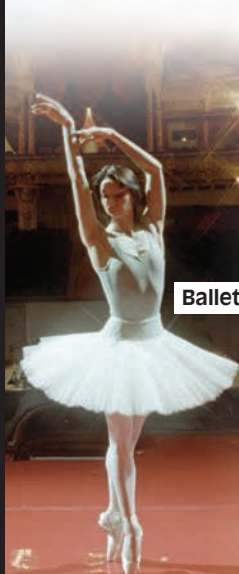
Ballet at the Bolshoi Theater