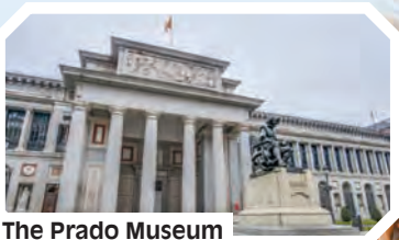
The Prado Museum