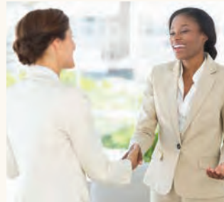
Some shake hands